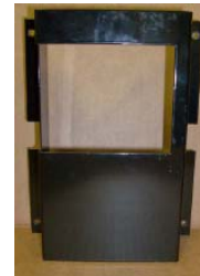
Original Coin Cup Security Bracket 647,050,39x.x3