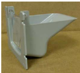
Original Coin Return Cup 801,821,29x.x1